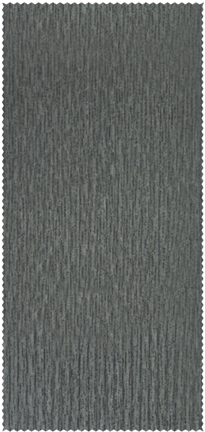
CACHMERE | GREY

Click on the arrow to go back to the index page