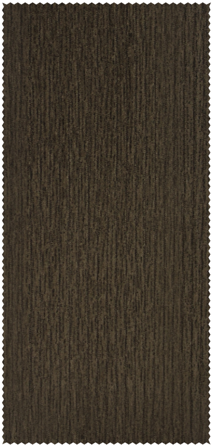
CACHMERE | BROWN