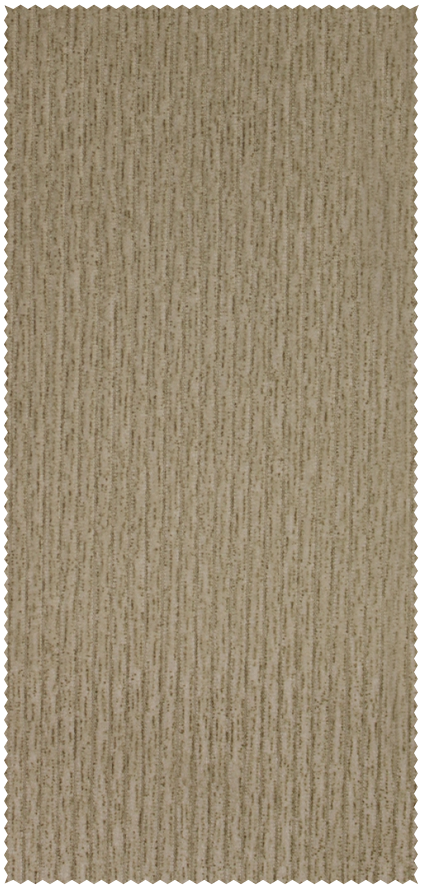
CACHMERE | BEIGE

Click on the arrow to go back to the index page