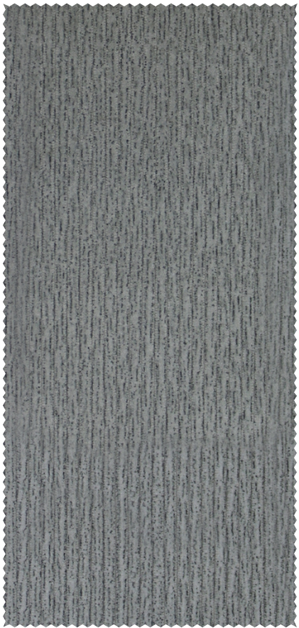
CACHMERE | SILVER

Click on the arrow to go back to the index page