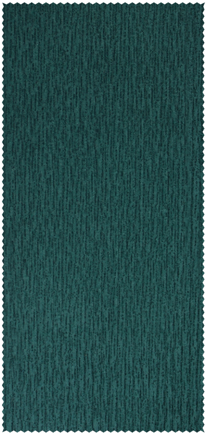
CACHMERE | JADE

Click on the arrow to go back to the index page